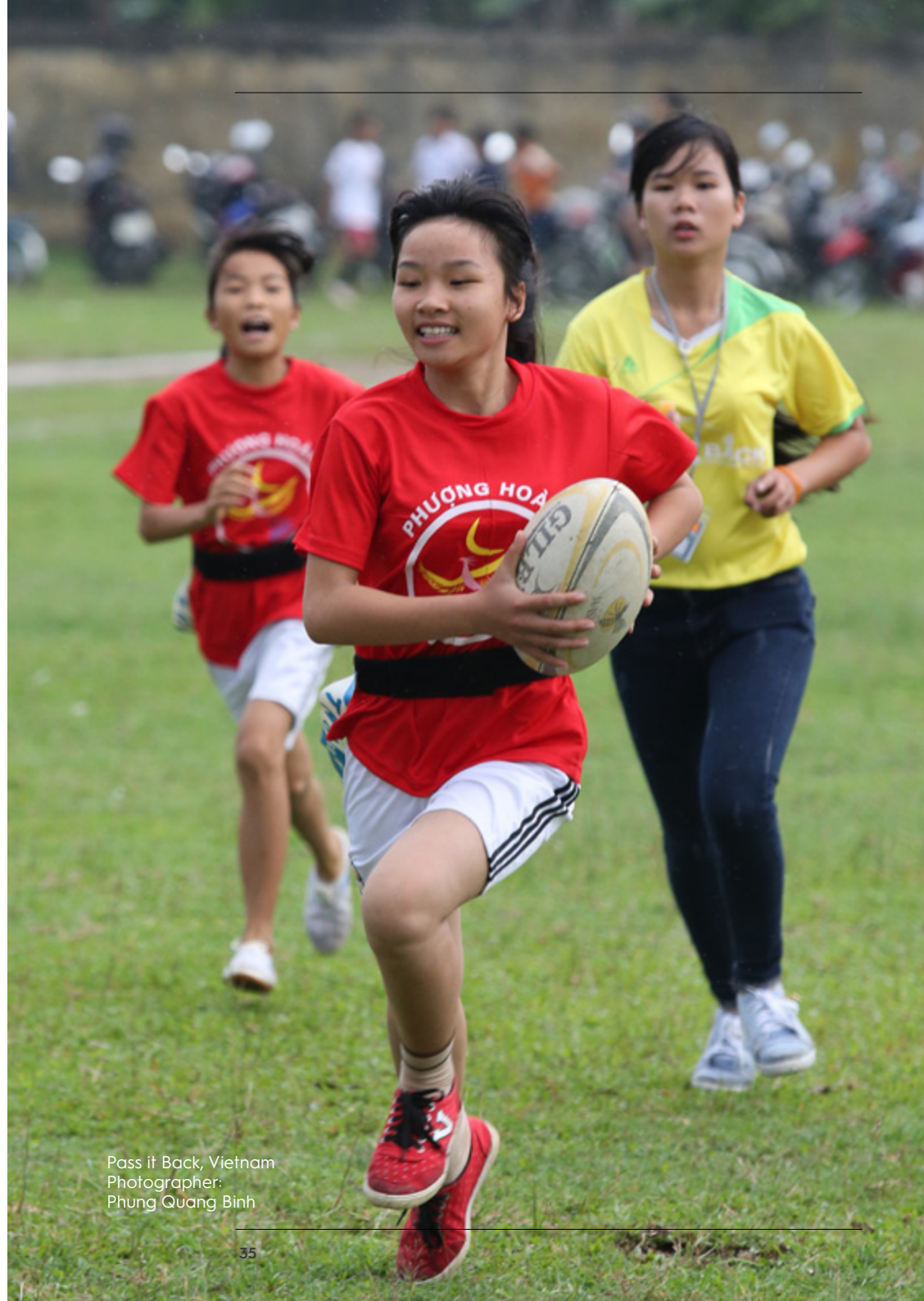
Pass it Back, Vietnam